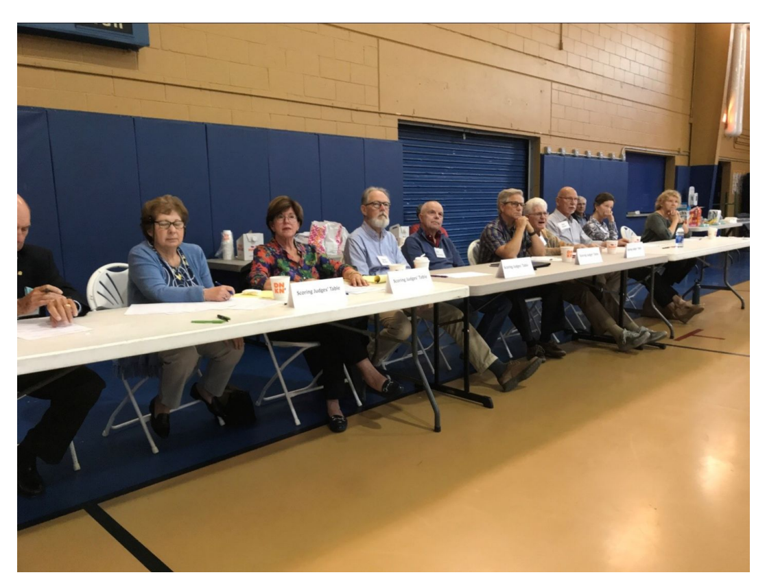
High School Academic World Quest Scorers Watch the Action

Traditionally, the Council sponsors the winning team to contend in the National Academic World Quest Competition in Washington, DC. Unfortunately, owing to the coronavirus pandemic, that competition was cancelled. But we still have plans to reward the winners accordingly, so keep checking back on our website for the award of the trophy.