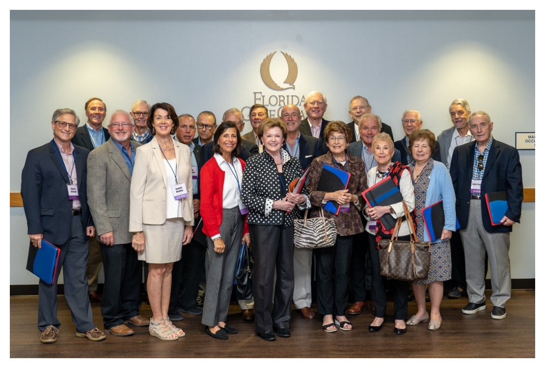
NCWA Judges for Lutgert Hall Committee Sessions

The disproportionately large number of women and persons of color that came on the stage to accept the approximately $40,000 in financial awards was especially notable and demonstrated that NCWA programs like Model UN reach all demographics of Southwest Florida's youth.