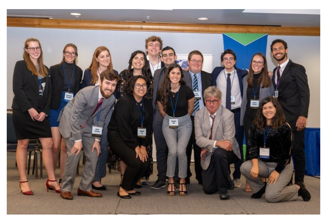
Florida Gulf Coast University Model UN Club Committee Chairs