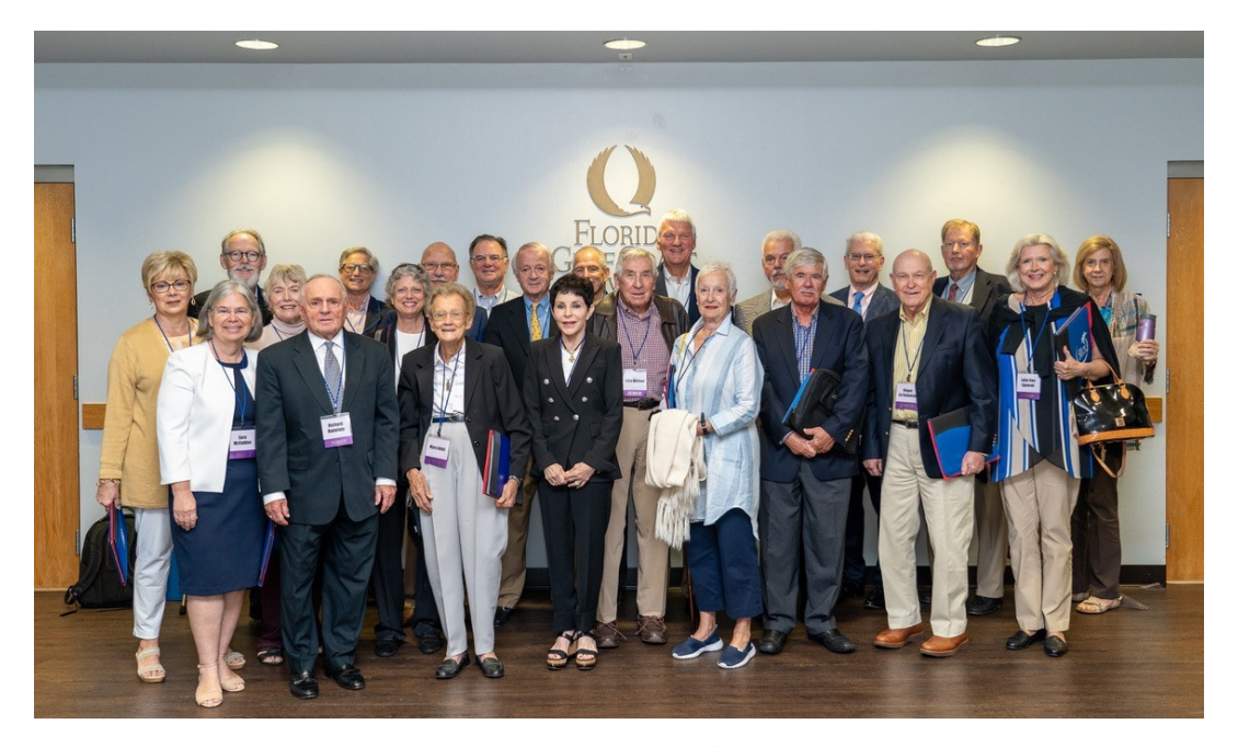
NCWA Judges for Merwin Hall Committee Sessions