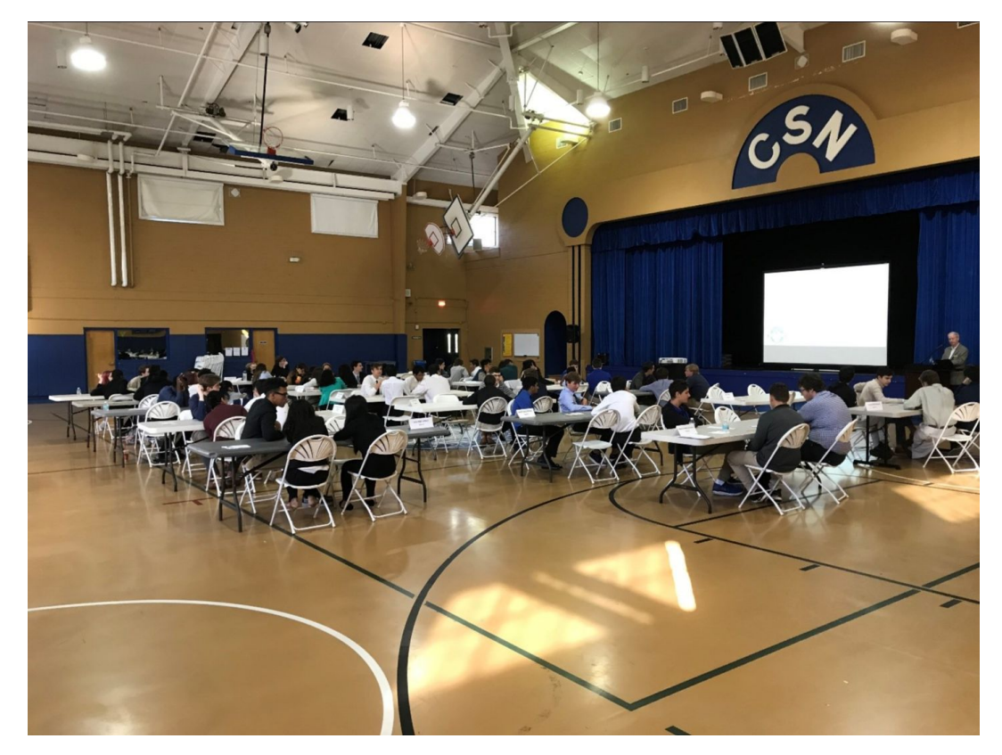
High School Academic World Quest at Mid-Question