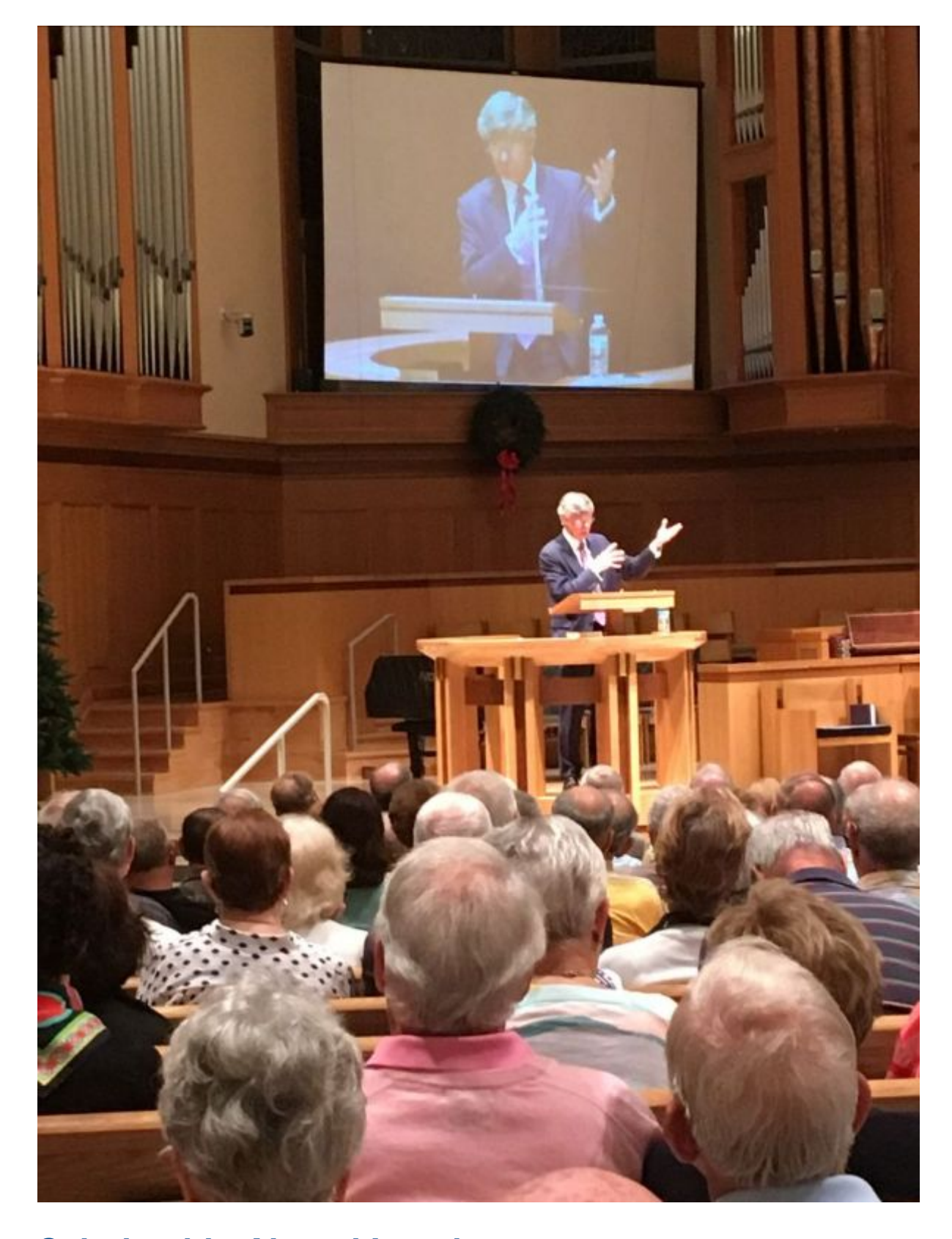
Scholarship Alumni Luncheon

The NCWA School Outreach Committee hosted a lunch for its 2018